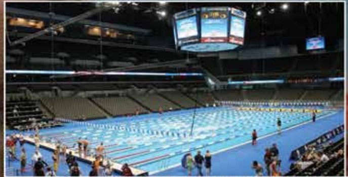
U.S. OLYMPIC TRIALS (OMAHA)