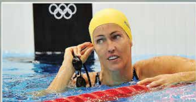
THERESE ALSHAMMAR, 6-TIME OLYMPIAN