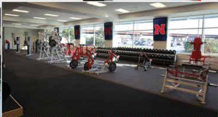
HENDRICKS COMPLEX WEIGHT ROOM