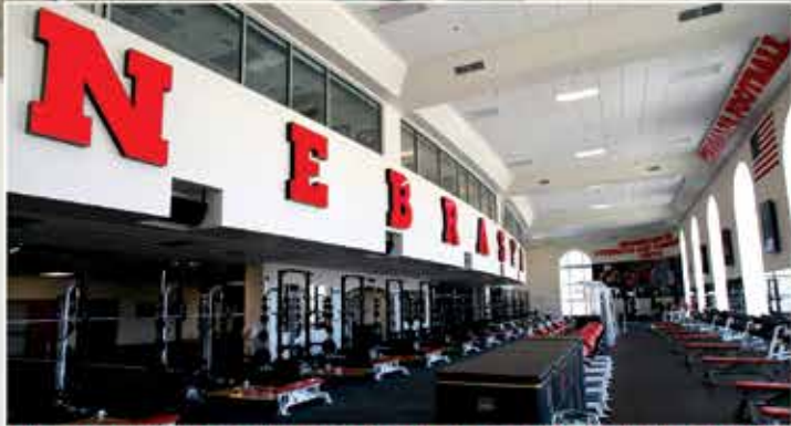
NDAMUKONG SUH STRENGTH & CONDITIONING CENTER