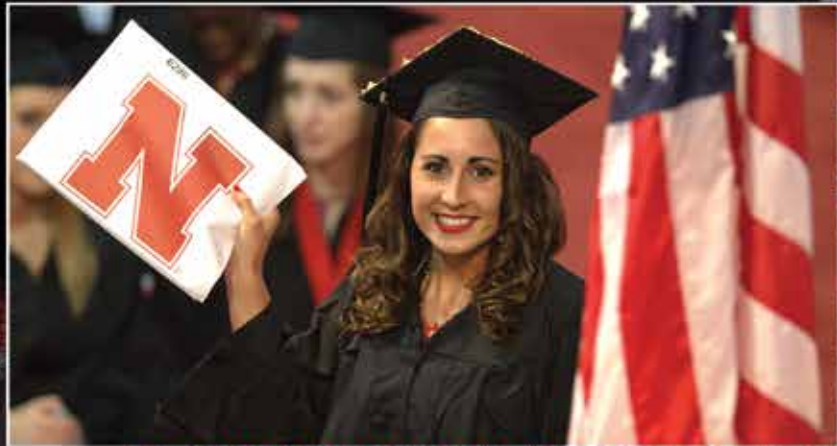
A TOP VALUE IN PUBLIC EDUCATION