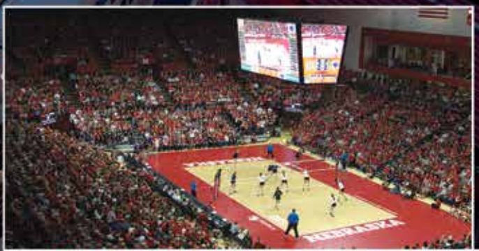
BOB DEVANEY SPORTS CENTER