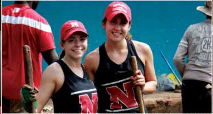
SERVICE TRIP TO NICARAGUA, 2017