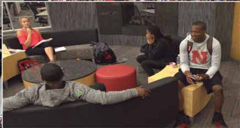
STUDENT LIFE COMPLEX