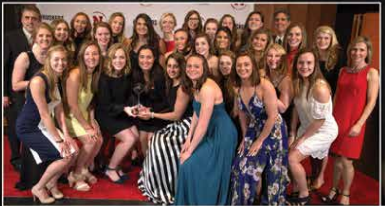
3-TIME NEBRASKA HERMAN TEAM GPA WINNERS