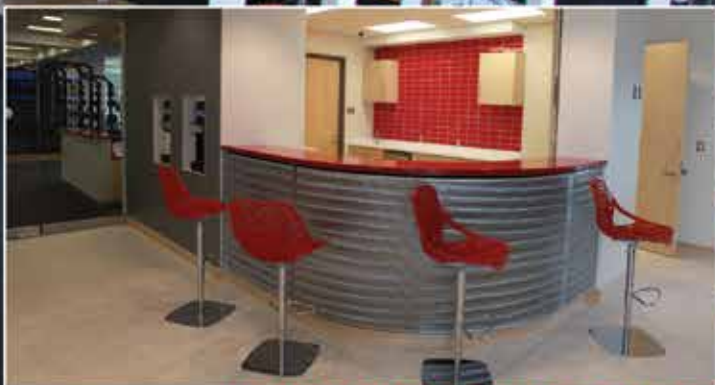
HENDRICKS COMPLEX OASIS