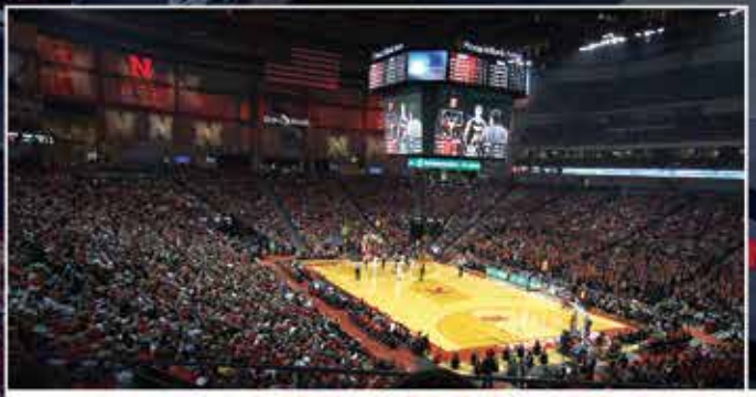
PINNACLE BANK ARENA