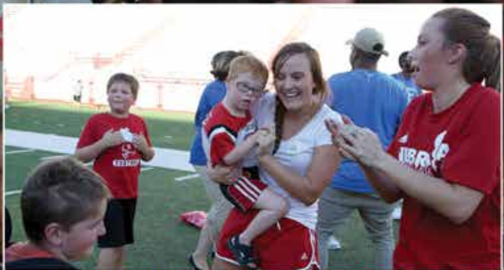
ANNUAL HUSKER HEROES EVENT