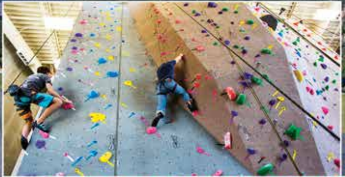
OUTDOOR ADVENTURE CENTER