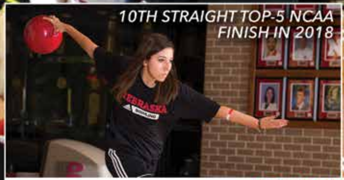
10TH STRAIGHT TOP-5 NCAA FINISH IN 2018