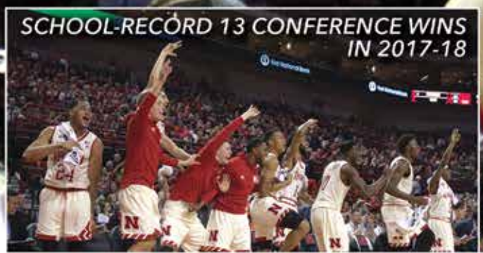
SCHOOL-RECORD 13 CONFERENCE WINS IN 2017-18