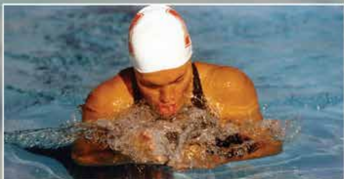
PENNY HEYNS, 2-TIME GOLD MEDALIST