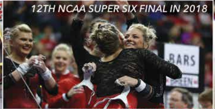
12TH NCAA SUPER SIX FINAL IN 2018