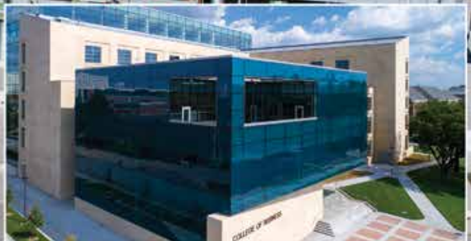
COLLEGE OF BUSINESS