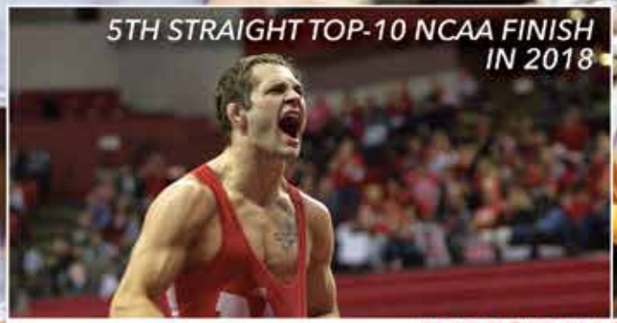
5TH STRAIGHT TOP-10 NCAA FINISH IN 2018