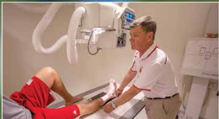
ON-SITE X-RAY FACILITY