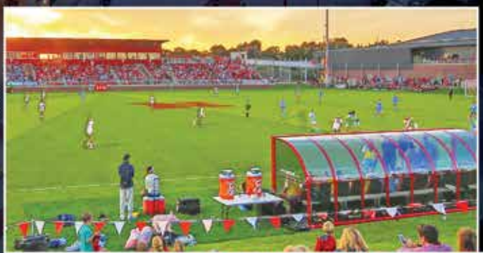
BARBARA HIBNER STADIUM